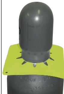
For 80 cu. ft. through 330 cu. ft. Style # SQ