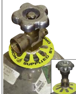
For 50 cu. ft. through 20 cu. ft. Style # C3