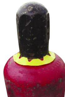
Acetylene Cylinder Style # AC