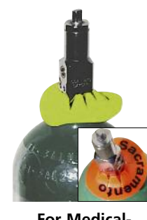
For Medical-Yoke, Mc & B Acetylene Style # C2