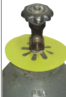
For 50 cu. ft. through 20 cu. ft. Style # C-4