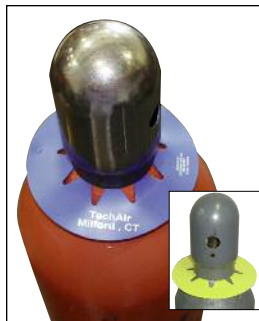
For 80 cu. ft. through 330 cu. ft. Style # RC