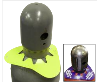
For 80 cu. ft. through 330 cu. ft. Style # C1