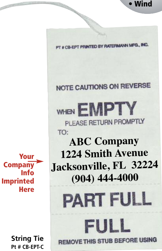
String Tie Pt # CB-EPT-C