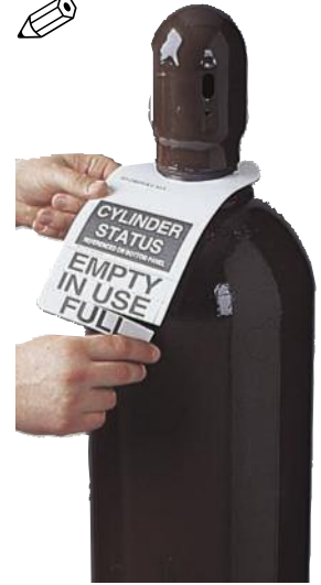
Tear off to identify cylinder status